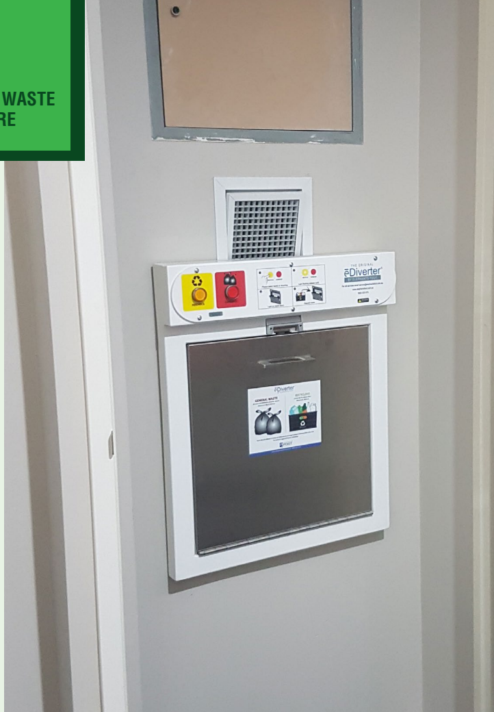
Diverter Chute Door and Control Panel, Wollri Creek

Within three months of initial occupation (and about 65% of the residential units inhabited) no noise complaints had been received. However, there had been 7 chute blockages (4 in the first month down to 1 in the third month) and residents were dumping waste on the floor nearby the chute door. The building manager revised educational messaging during this time and signage is now multi-lingual and uses images to convey meaning.